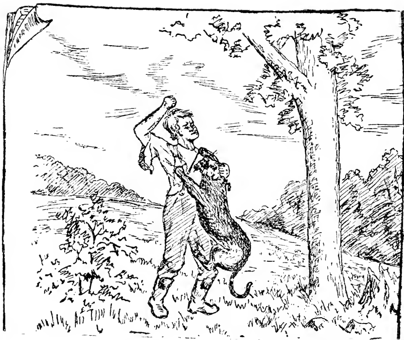
KILLING A PANTHER WITH HIS FISTS.